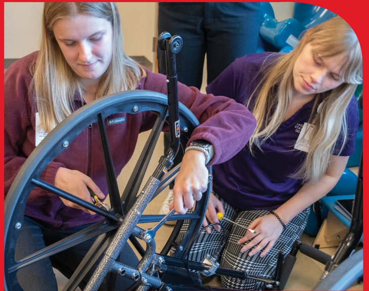
Occupational therapy students performing wheelchair assessments.