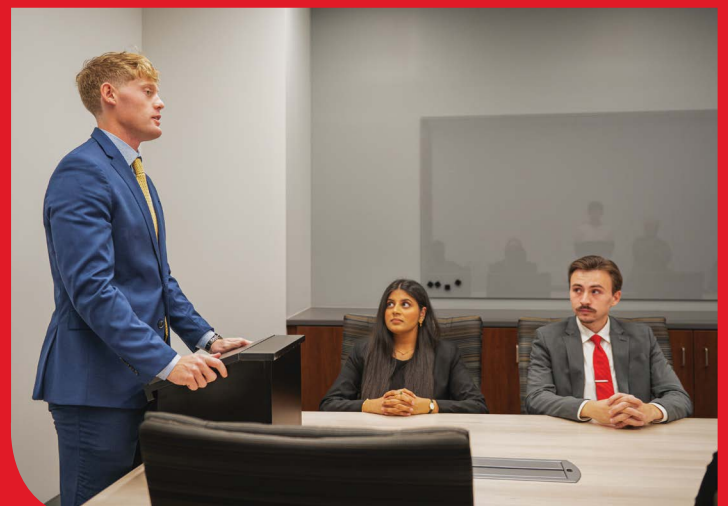
SVSU's moot court team is nationally ranked #4 for undergraduate competition.